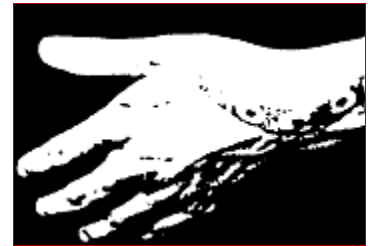
Tattoo that identifies members of the Triad "1 08" group in Singapore

In Australia, the Triad society Yee Hing Society with its charitable Mun Ji Dong has been listed as a "masonic charity" for 80 years. The Mun Ji Dong has decided to operate legally.