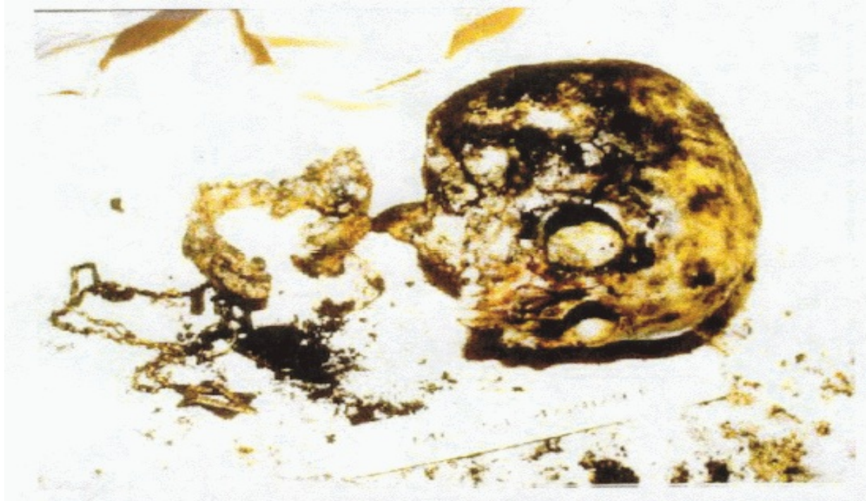
Remains of a two year old Davidian child, Mt. Carmel Doe 51A, photographed on May 7, 1993, just 18 days after alleged date of death. The remains have never been identified.

I believe that even the most reluctant of we Americans can clearly see who is breaking the law and who is lying, but the law breaking and lying does not end here. By now we perhaps have a different picture of the Branch Davidians than we did by just listening to the main stream media. Do you think that it's possible that those in charge, along with some of their zealots, became angered when the Branch Davidians didn't collapse and crumble as expected under the psychological stress that had been placed upon them and decided for other tactics, more brutal in nature?